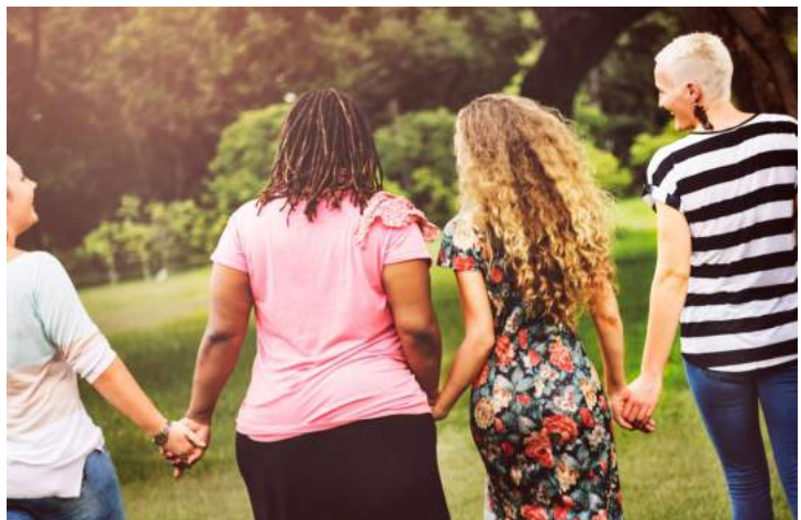
Build a strong team