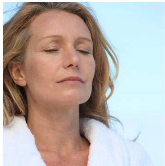
Listen to your inner knowing