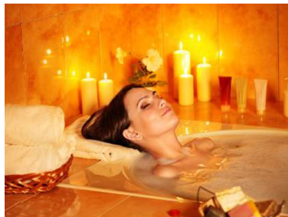
Do things that make you feel good