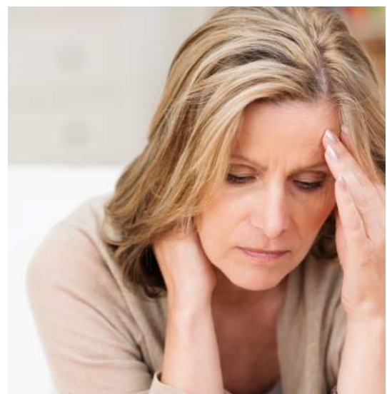
Embrace your feelings